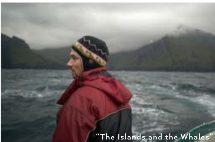
"The Islands and the Whales"

Chasing Coral COSMOS: A SpaceTime Odyssey Dangerous Exposure Hell and High Water The Islands and the Whales Virunga Gardeners of Eden Get Real: Heart of the Haze Planet Earth II