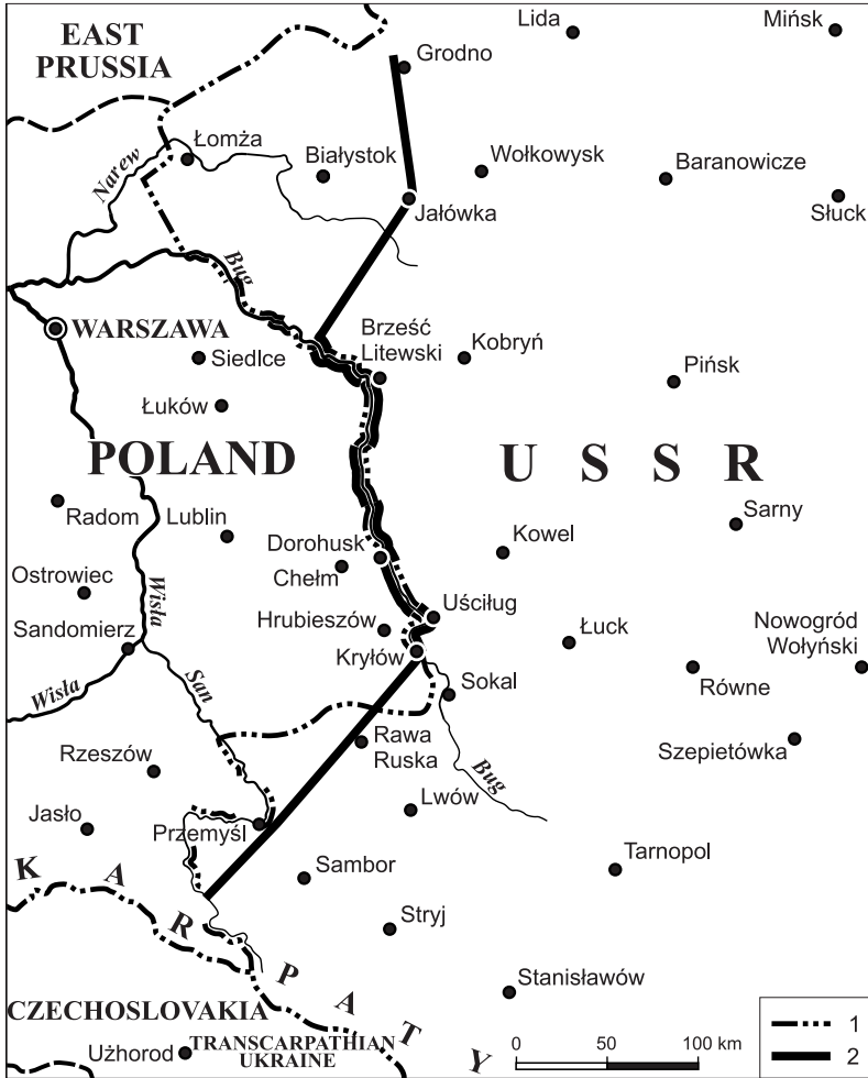
Figure 4. The Curzon Line according to the Soviet view. State boundary: 1 – of the USSR; 2 – the Curzon Line.