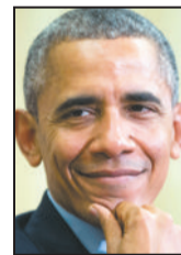
Obama: First U.S. president to visit Cuba in 88 years.