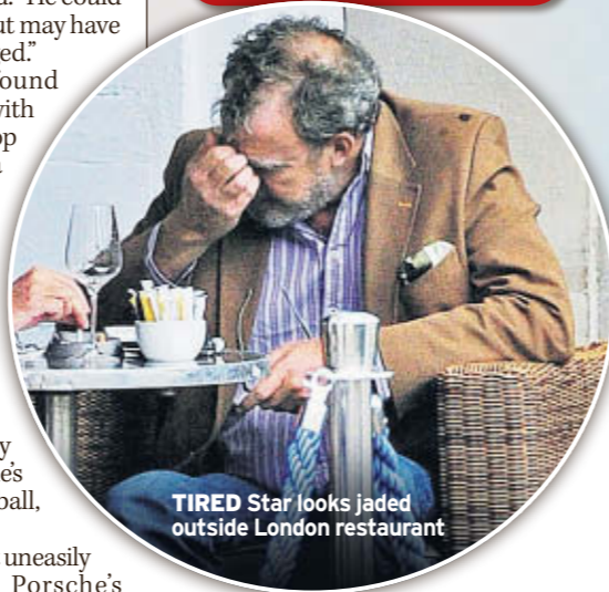
TIRED Star looks jaded outside London restaurant

JIM SHERIDAN LABOUR MP ON BBC NUMBER PLATE SCANDAL