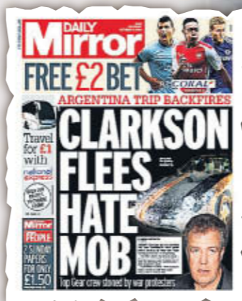
HORROR Our front page story on the attack on presenter

“If the BBC are involved in a cover-up to protect this man it's unforgivable”