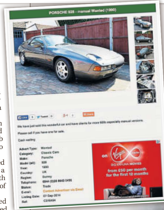
CONTROVERSY Ad with Porsche the BBC bought

a classics car website. It is on an advert asking for similar owners to come forward – saying they have sold the one pictured. The registration is blurred. The original ad that alerted the BBC to the Porsche, which was bought in the summer, has yet to be uncovered. Argentinians believe the BE11