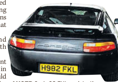
ANGER Car's 82 FKL registration

Court sources said the use of different number plates to those that appear in the car's official documentation would constitute a crime of falsification. The