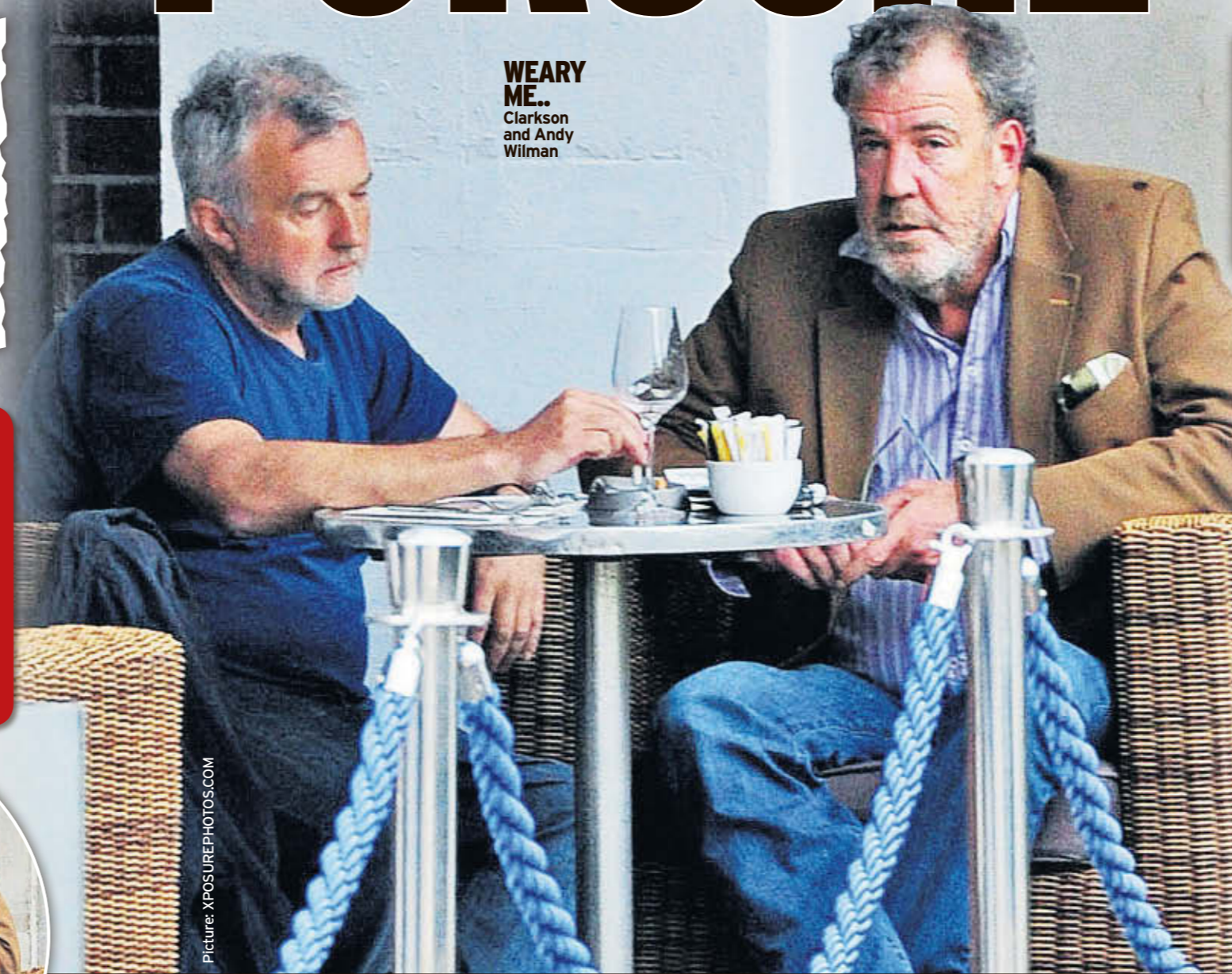
WEARY ME... Clarkson and Andy Wilman