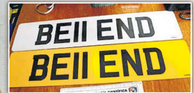
NUMBER'S UP Plates that were going to be used in stunt

Falklands reg plate was fluke say Beeb, but Top Gear had number plate 'joke' planned... and now dealer who sold car 'can't talk about it'