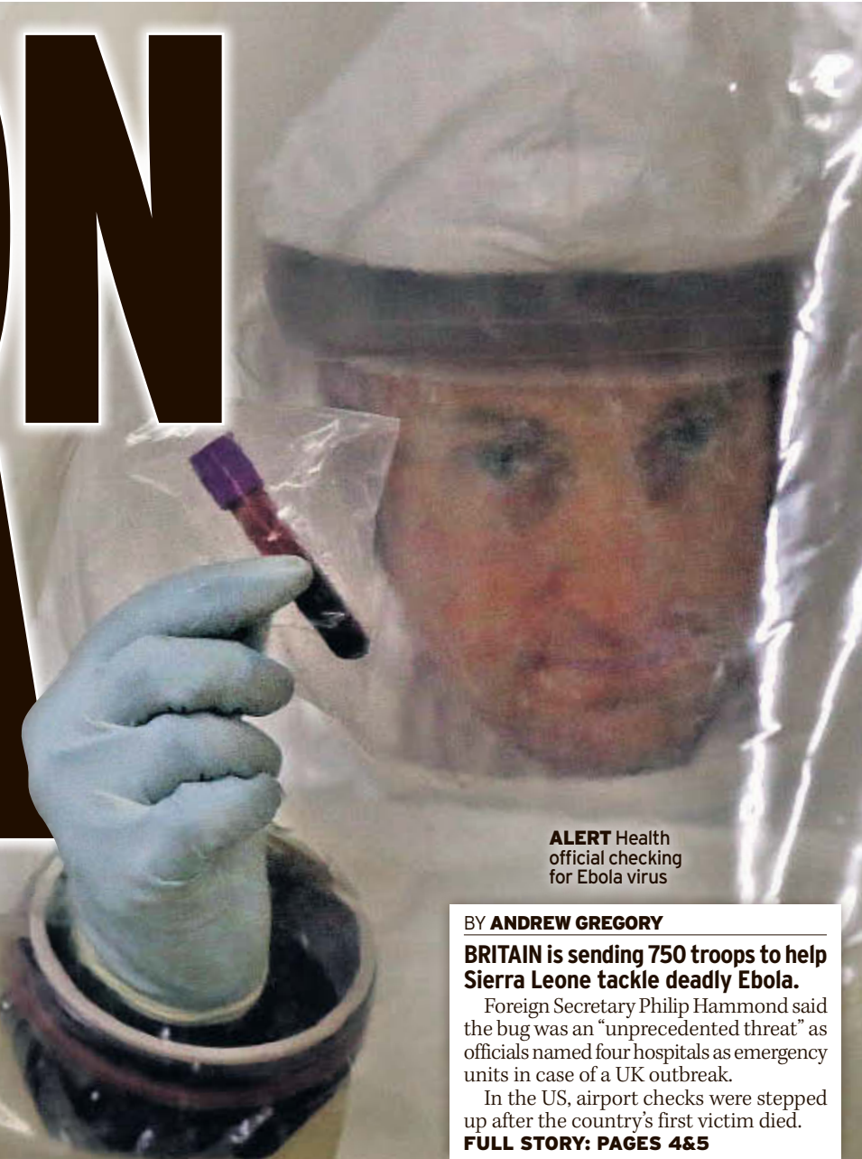
ALERT Health official checking for Ebola virus