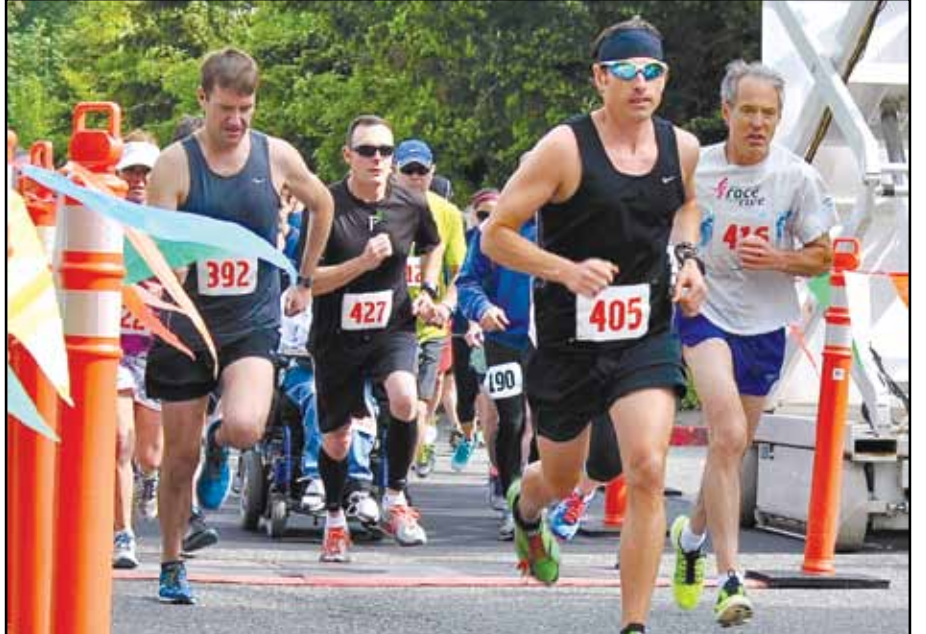
Runners at the start of the Flight for Sight.

Over the past 13 years, the Flight for Sight has raised approximately $147,000 for Guide Dogs of America.