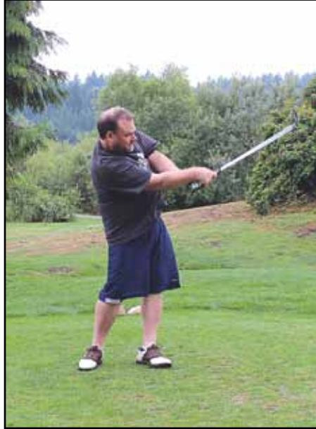
The annual Guide Dogs of America Charity Golf Tournament is July 20 in Redmond.

Ocean Sportfishing Charters, which is at 2549 Westhaven Drive in Westport. Boats will be filled on a first-paid basis with District 751 members and their guests. They will leave at 5:30 a.m. on derby day and will return by 5:30 p.m.