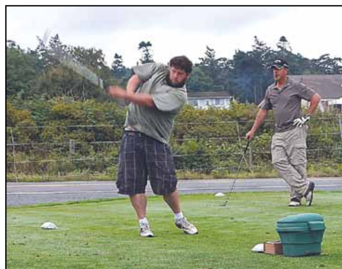
Last year's tournament, organized by IAM 751 members at NAS Whidbey, raised more than $3,500 for North Whidbey Help House.

District 751 represents about 250 civilian workers at NAS Whidbey who are employed by L-3 Communications, Delaware Resources Group and Doss Aviation.