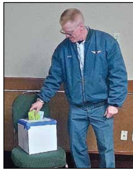
Machinists working at Doss Aviation at Whidbey Island Naval Air Station ratified their first union contract in June with an 88-percent yes vote.