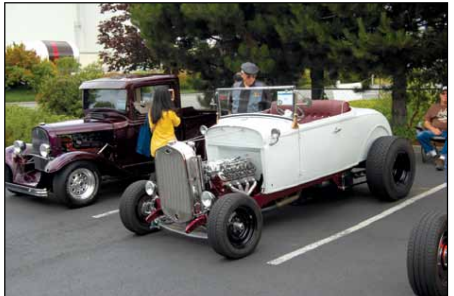
The annual Bill Baker Memorial Steel & Wheel SuperShow is Saturday, August 16 from 10 a.m. to 3 p.m. at the Everett Union Hall, which features live music and food.