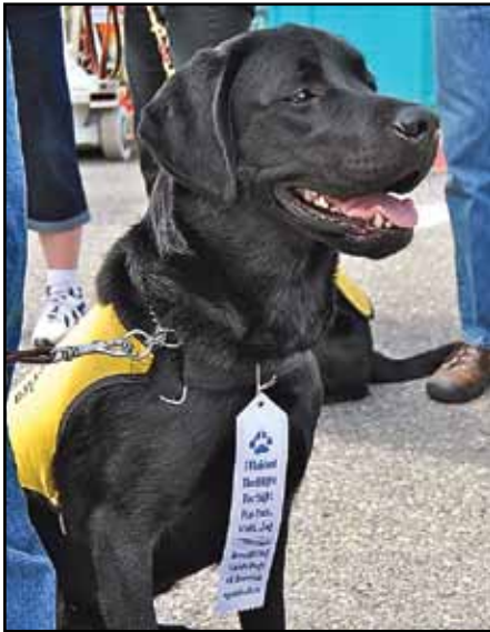
One of the Guide Dogs puppies-in-training proudly wears a Flight for Sight finisher's ribbon.