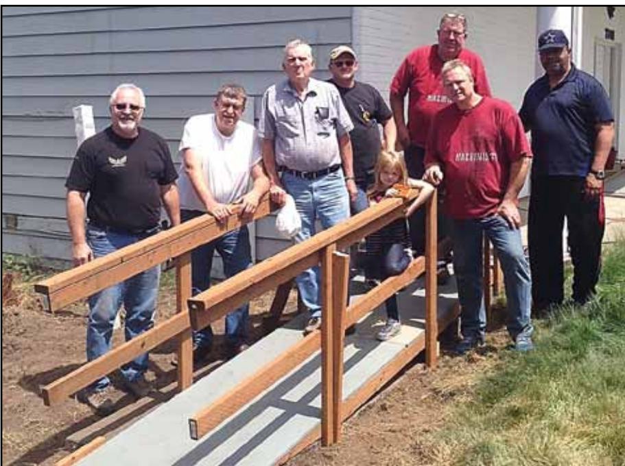
Machinists Volunteer Program members built two wheelchair ramps in June, one in Lakewood (above). Photo right: Machinists building a ramp in Buckley.