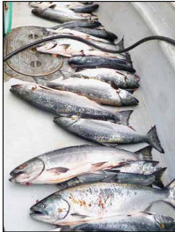
Scientists are trying to figure out how much wild fish Washington residents catch and eat, as part of a process to set water-quality standards. District 751 is working toward a solution that protects public health, the environment -- and our jobs.

All of our lakes and rivers contain some level of contaminants due to human activities. Rainwater runs off our roofs, yards, streets, and parking lots and factories use water for cooling and cleaning. The runoff from our communities and factories contain some level of contaminants which end up in our rivers and lakes. Some of these contaminants are cancer-causing. The fish absorb the toxins and they get passed on when people eat the fish. The more fish people eat, the higher their risk and the greater