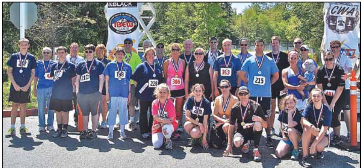
Flight for Sight winners in each age category pose for photos with their medals at the start/finish line at the Boeing Everett Events Center.