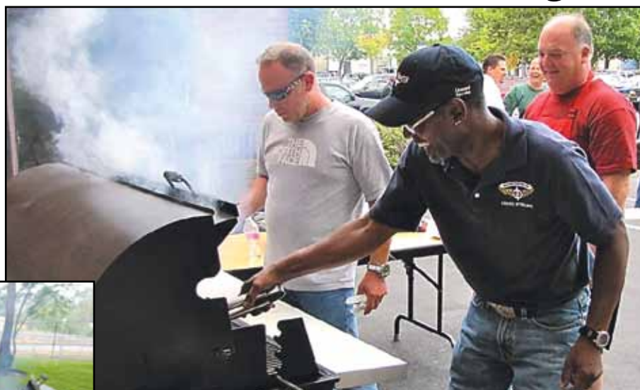
District 751's lodges in Puget Sound will host barbecues for members in August.

"Whether we're having burgers or breakfast, it's a great opportunity for everyone to come out, have a nice meal and talk about union business in a fun and relaxed