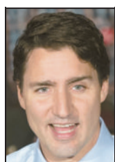
Liberal leader Justin Trudeau