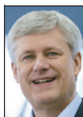
Conservative leader Stephen Harper

44 on Christmas Day, will become Canada's second-youngest prime minister and the first to follow a parent into office. The youngest prime minister, Joe Clark, a Conservative, took office in 1979 the day before he