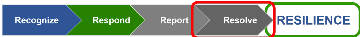
Figure 6. How to Mitigate RF Interference - Resolve

Once public safety agencies have recognized, responded to, and reported an RF interference incident, they must resolve it by identifying lessons learned at an agency level so they can apply them to improve future incident response. To better prepare, an agency should focus on the following: