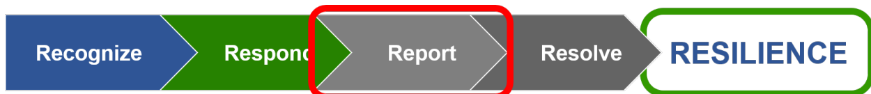
Figure 5. How to Mitigate RF Interference - Report