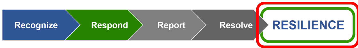
Figure 7. How to Mitigate RF Interference - Resilience

Applying best practices from this document will help public safety organizations become more resilient to RF interference. Everyday preparedness through training, developing and implementing standard operating procedures (SOP) for special events, and educating staff on the threats of RF interference incidents will enable entire organizations to be vigilant. When more staff learn to recognize, respond to, report, and resolve RF interference incidents, the organization becomes more resilient and can return to efficiently operating without disruption.