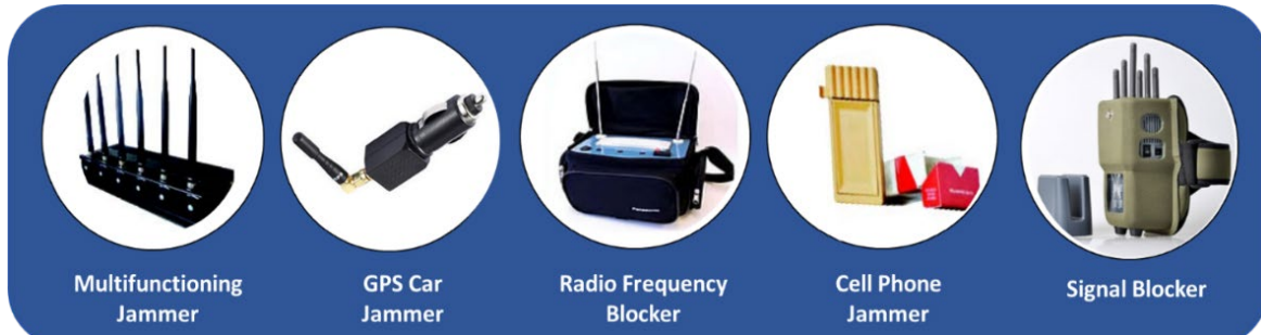
Figure 1. RF Jammer Examples

Outside the U.S., RF jamming devices are commercially available, however the cost and supported range varies significantly by device. It is difficult to detect the presence of low powered jammers as they are often cheaply made overseas and emit inconsistent signals. Moreover, these devices, examples of which are outlined in Figure 1 below, are easily concealed, mobile, and can be effective in concentrated areas.