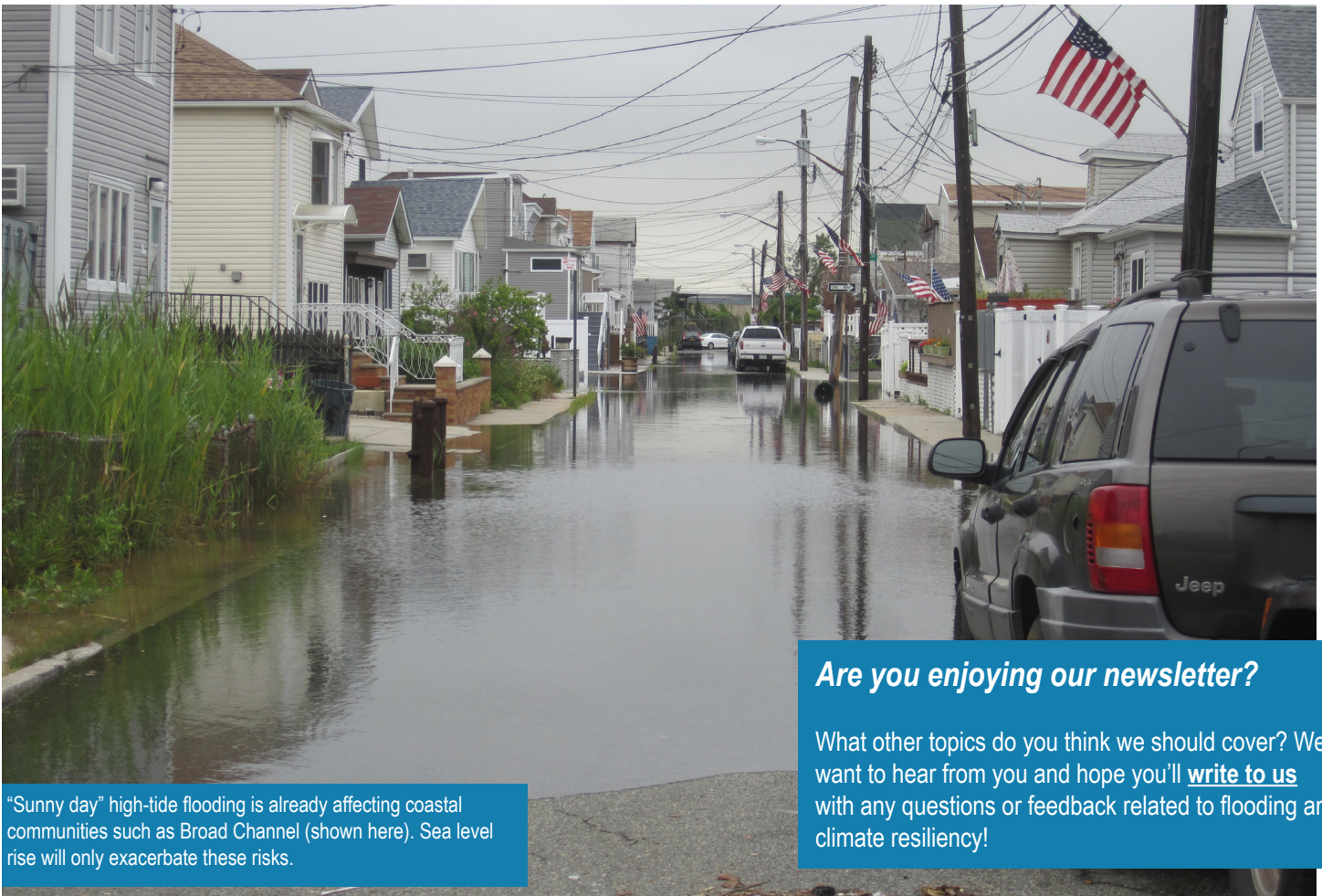
“Sunny day” high-tide flooding is already affecting coastal communities such as Broad Channel (shown here). Sea level rise will only exacerbate these risks.

As we continue to work on making NYC’s coastline safer and more accessible, it is important to understand the various types of risks that we face; sea level rise results in slow, permanent flooding to very low-lying areas on the coast, essentially altering the shape of our shoreline, and therefore our city.