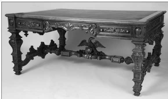
The Rococo table in S-223

The highly ornamented Rococo table in S-223 was originally purchased for the Vice President's Room in 1860. The table remained in the room until 1898 and was used by ten vice presidents.