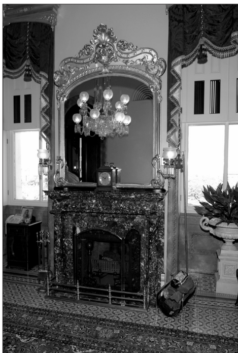
Fireplace mantel and mirror in S-223

The suite is lighted throughout by nickel-plated brass and crystal chandeliers. While not the original light fixtures, these crystal chandeliers are 1910s copies of chandeliers from the White House. According to accounts, seven White House chandeliers were installed in the Capitol and generated so much interest that replicas were produced for many offices.