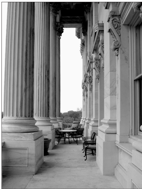
The jib door in S-221 leads to this balcony

While many rooms in the Capitol have spectacular views, the placement of the Democratic leader's suite allows for views of the Mall and the Capitol dome. From S-221 the view can be enjoyed on the portico balcony. The balcony is accessed through the north window—actually a jib or “window” door, and is one of only two still in use on the Senate side of the Capitol. By lifting the bottom sash and opening a pair of small doors under the sill, the window functions as a door, providing access to the balcony while maintaining the appearance of a window to keep with the room and building's symmetry.