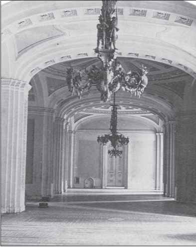
View of the principal corridor near the Senate Chamber from room S-224, ca. 1860

This desirable office space was first assigned to the Office of the Secretary of the Senate, whose responsibilities necessitate access to the Chamber floor. The secretary plays an essential role in the functioning of the Senate, overseeing an array of legislative, administrative, and financial services needed for the daily operation of the Senate.