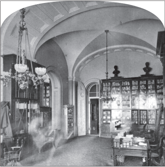
View of S-221, ca. 1860