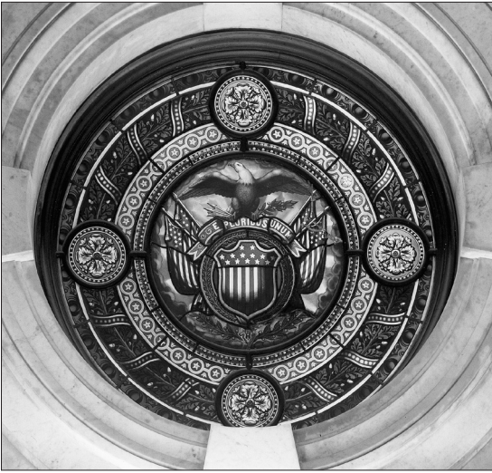
Stained glass window in S-222

Another uncommon architectural element is found in S-222, and is one of only four in the Capitol. The stained glass window depicting a shield, an eagle, flags of the U.S., and the motto E Pluribus Unum (Out of many, one), garners attention. The window provides light to the lower staircase on the other side of the wall, thus accounting for its seemingly unusual placement.