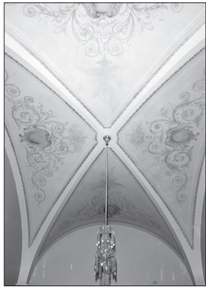
Restored ceiling in S-224

The Senate and House extensions, designed by Thomas U. Walter and built by Montgomery C. Meigs, were meant to inspire visitors to reflect upon the Capitol as a symbol of American democracy. To that end, the extensions contain the finest workmanship, the most exquisite building materials, and the latest technologies then available. Many of the offices in the new wing have groin-vaulted ceilings, monumental doors and windows set in ornate cast-iron frames, carved marble fireplace mantels, and colorful and intricately patterned English floor tiles from Minton & Company.